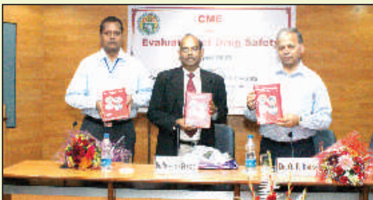
15 th Prof. Raman Viswanathan-VPCI Oration