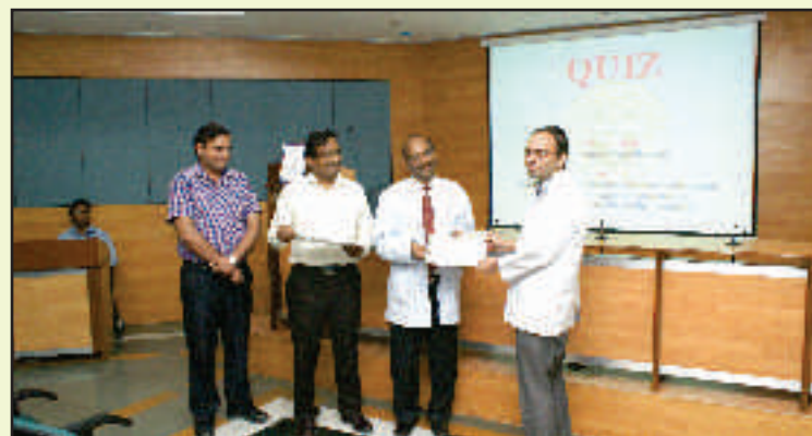
World Asthma Day